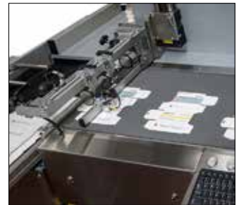
The high-precision vacuum transport that handles the carton contributes significantly to the excellent print quality and to the highest possible code grading and readability.