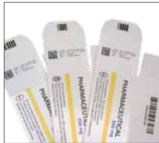
All internationally known serialization styles including the Chinese veterinary QR-code can be produced in a process safe way in combination with the Unique Code Software.