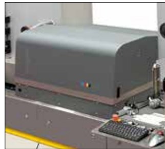
The OMEGA Pro color inkjet with 600 dpi resolution guarantees a consistently high print quality thanks to UV curable inks that are resistant to water and solvents. Monochrome inkjets can be equipped alternatively.