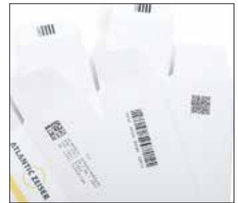
All common, international coding principles including the Chinese veterinary QR code can be easily covered and realized with DIGILINE Single Pharma in combination with Unique Code Software – process safe at all times.