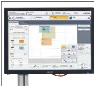
Intelligent graphic user interface for easy and intuitive job set-ups; all modules present are automatically added.