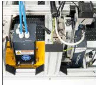
The OMEGA DoD inkjet technology guarantees consistent high print quality thanks to UV curing inks resistant against wear, water and solvents.